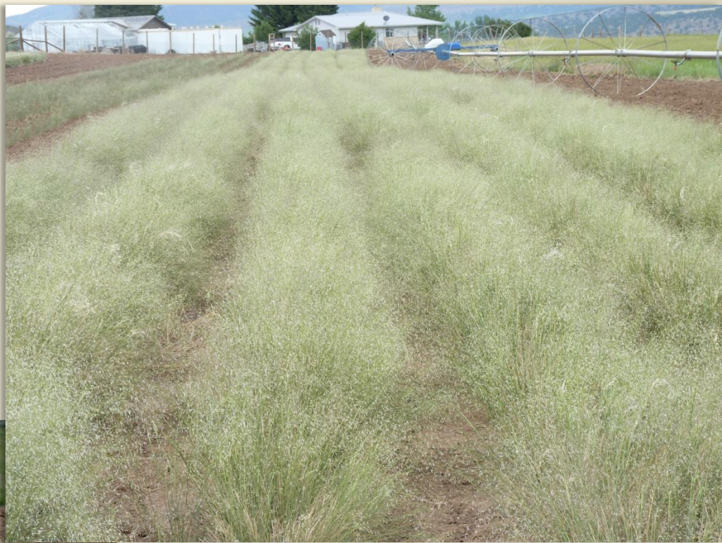
Accession 661 (Delta, CO)