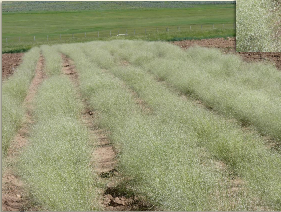
Accession 749 (Durango, CO)